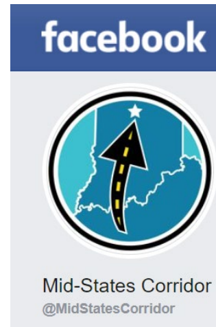
Figure 7-3: Image of Facebook Page