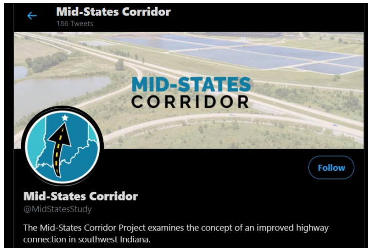
Figure 7-2: Image of Twitter Handle